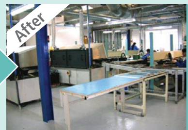
Rooms & Corridors